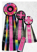
Example of our Ribbons accents will be different.